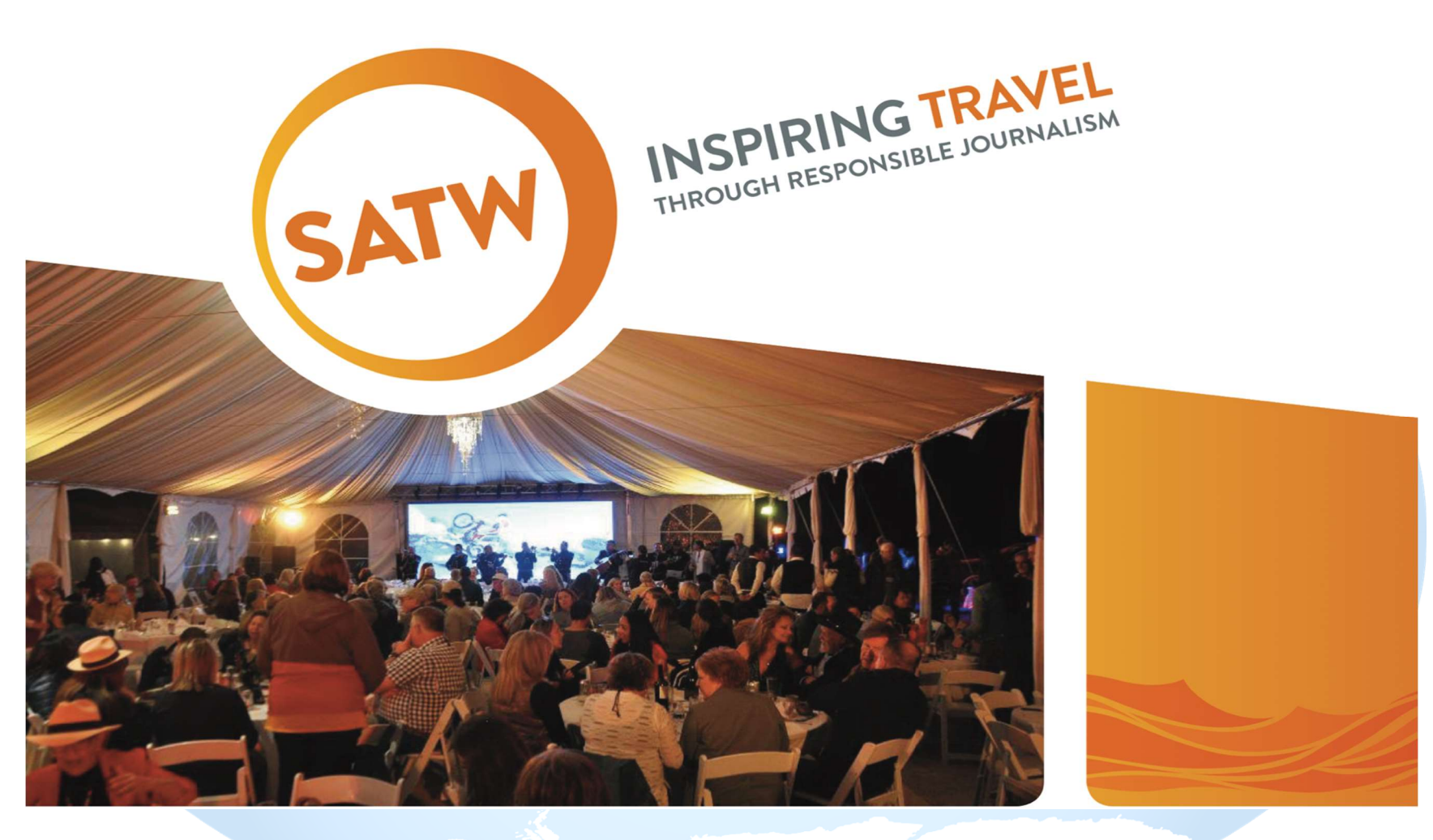
SATW Request for Proposals Annual Convention